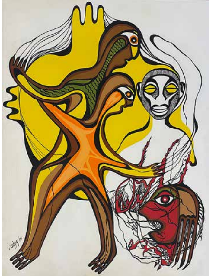
Daphne Odjig, Rolling Head , 1970. Acrylic on board. Overall: 101.6 × 76.2 cm (40 × 30 in.). Purchase, with funds from the Beryl Ivey Fund, 2024 © Estate of Daphne Odjig