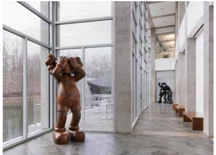
Installation view, KAWS: FAMILY, March 15 – July 28, 2025, Crystal Bridges Museum. © KAWS. Photo: Dan Bradica

Speed Art Museum, Louisville, Kentucky July 12, 2024 – January 12, 2025