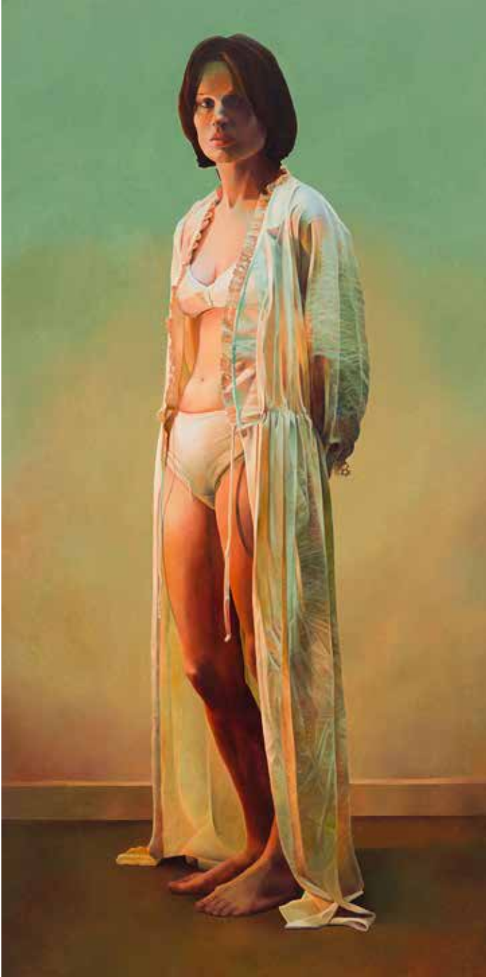
Mary Pratt, Girl in My Dressing Gown , 1981. Oil on board, Overall: 153.7 × 77.5 cm. Art Gallery of Ontario. Purchase, with funds from the Beryl Ivey Fund, 2024. © Estate of Mary Pratt / CARCC Ottawa 2025. 2024/1

The AGO's collection of over 120,000 works of art continues to grow as the museum focuses on acquiring masterworks, important collections, and art that speaks to contemporary global issues. Here are just a few of the extraordinary works that entered our collection in 2024–25.