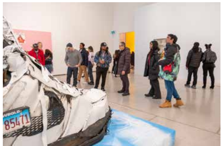
Installation views, Making Her Mark: A History of Women Artists in Europe, 1400–1800 ; Pacita Abad. Artworks © Pacita Abad Art Estate; The Culture: Hip Hop and Contemporary Art in the 21st Century .