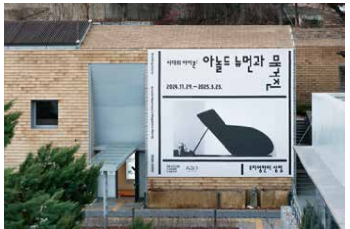
Poster for Building Icons: Arnold Newman's Magazine World, 1938–2000 at Museum Hanmi in Seoul, South Korea