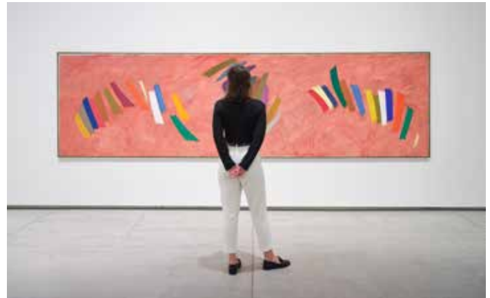
Installation view, Moments in Modernism . Work shown: Jack Bush, Salmon Concerto , 1975. © Estate of Jack Bush / CARCC Ottawa, 2025.