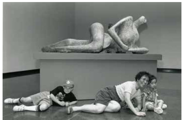
Visitors in the Henry Moore Centre circa 1993

The City of Toronto proclaimed November 13, 2024, to be Henry Moore Day, in recognition of the 50th Anniversary of the Henry Moore Centre at the AGO. The museum holds the world's largest public collection of Henry Moore's art with more than 900 works, including rare plasters, bronze sculptures, maquettes, drawings, prints, and sketchbooks.