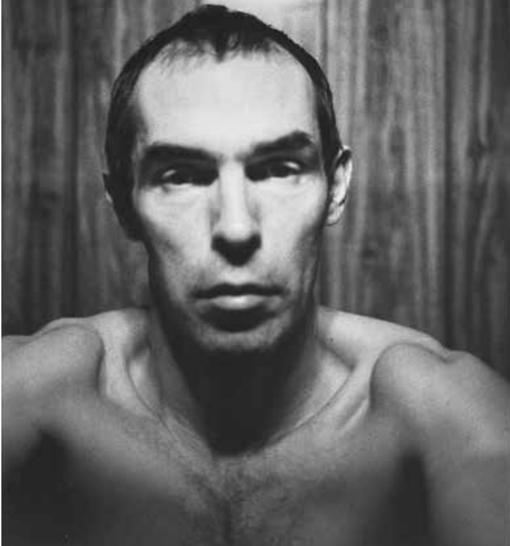
Peter Hujar, Self-Portrait in the Baths , 1979. Gelatin silver print. Overall: 50.8 × 40.6 cm. Art Gallery of Ontario. Purchase, with funds from Martha LA McCain and George Yabu & Glenn Pushelberg, 2024. © 2025 The Peter Hujar Archive / CARCC, Ottawa 2025. Courtesy Fraenkel Gallery, San Francisco, and Pace Gallery, New York. 2024/6

This acquisition is part of the Photography department's recent focus on acquiring works created in the 1970s and 1980s: a fertile period when artists expanded documentary approaches and infused popular photographic forms, like snapshots, film stills, and advertising images with artistic intent. These works build a rich portrait of a shifting field, with Hujar as a key figure whose legacy continues to influence artists today.