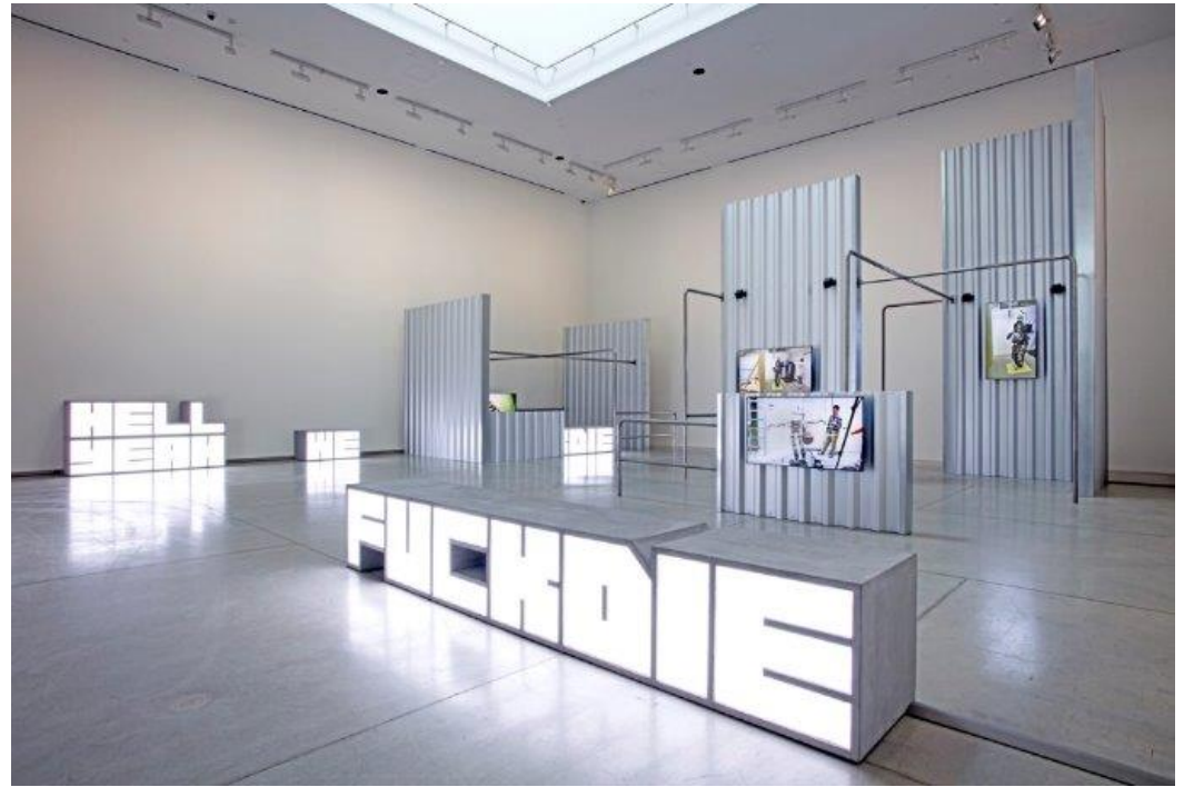
Above: Hito Steyerl, Hell Yeah We Fuck Die , 2016. Installation view from Hito Steyerl: This is the future exhibition at the AGO, 2019.