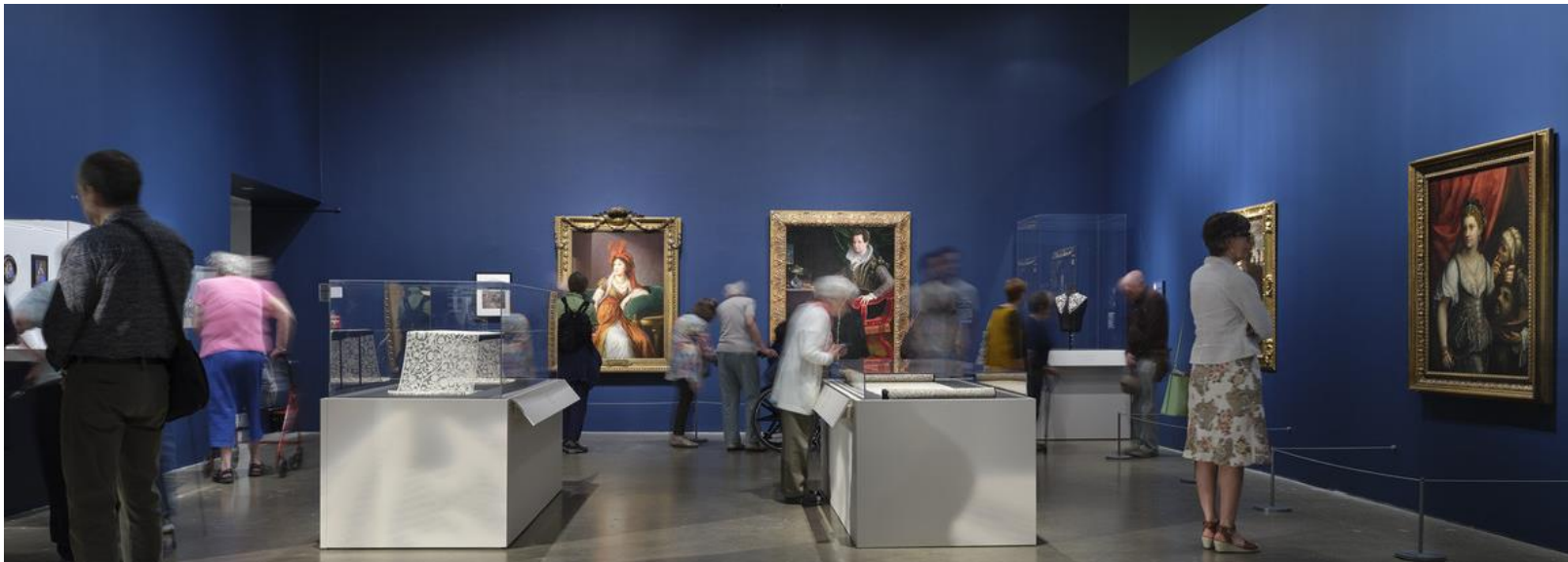
Visitors in the Making Her Mark: A History of Women Artists in Europe, 1400 - 1800 exhibition.

This extraordinary exhibition celebrated the central role of women's creativity in European culture over four centuries. In doing so, it shone an overdue spotlight on women artists and prompted a meaningful reconsideration of how audiences view this period of art history.