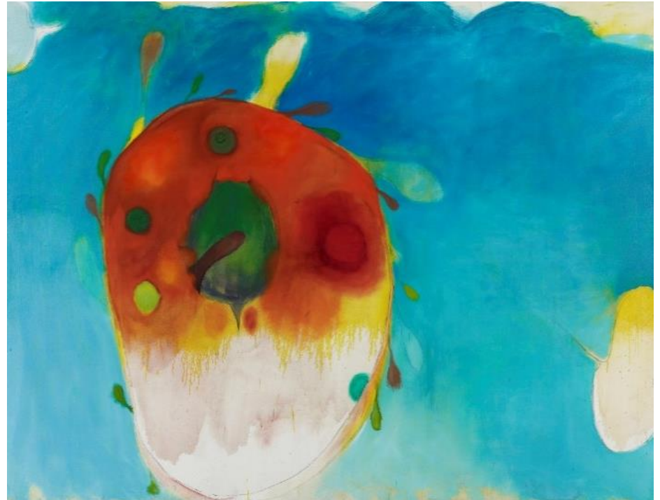
Joyce Wieland, Canadian, 1930 - 1998, Time Machine Series, 1961. Oil on canvas, Overall: 203.2 x 269.9 cm (80 x 106 1/4 in.). Art Gallery of Ontario, Gift from the McLean Foundation, 1966 65/25.

As the AGO celebrates its 125 th anniversary, WAI looks forward to celebrating this next step in our journey of supporting women artists—one that will help shape the AGO and the world of art for generations to come.