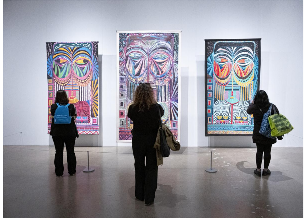
Visitors in the Pacita Abad exhibition

In addition, we are only two years away from the opening of the Dani Reiss Modern and Contemporary Gallery, an expansion that will significantly increase gallery space for presenting art—including works by the world's most exciting women artists.