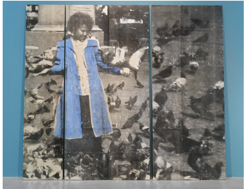
Above: Sandra Brewster, Feeding Trafalgar Square , 2021. Photo-transfer on wood. Commission, with funds from the Women's Art Initiative, 2021. © Sandra Brewster