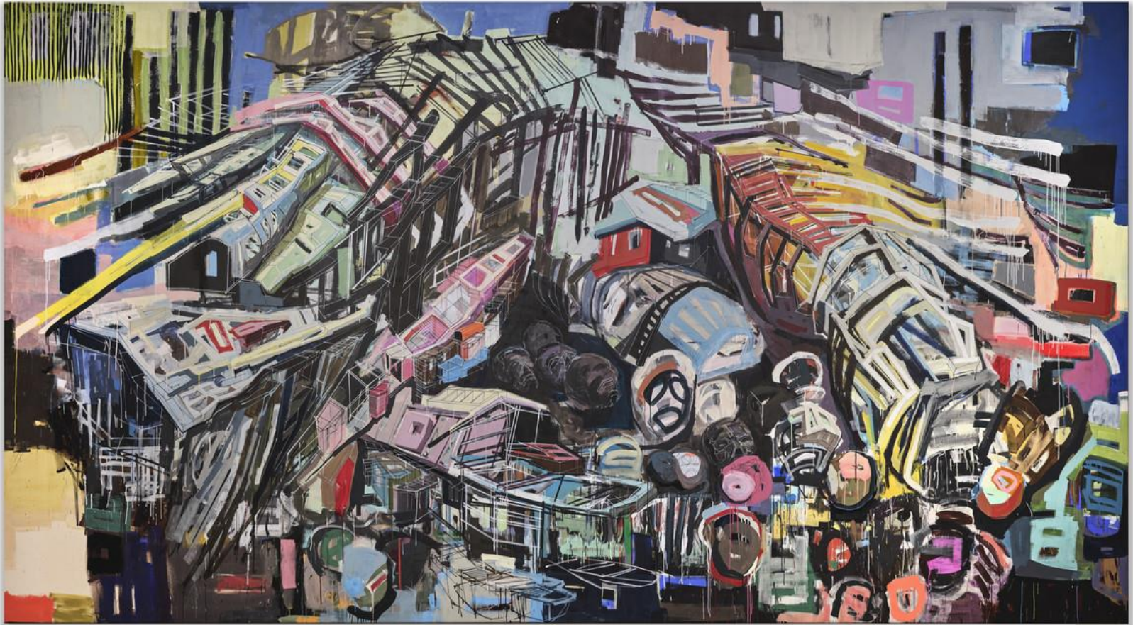
Denyse Thomasos, Arc , 2009. Shopping carts, wire mesh and clay. Acrylic on canvas, 335.3 × 609.6 cm. Art Gallery of Ontario. Purchase, with funds from the Women's Art Initiative, 2022. © The Estate of Denyse Thomasos and Olga Korper Gallery. 2021/356